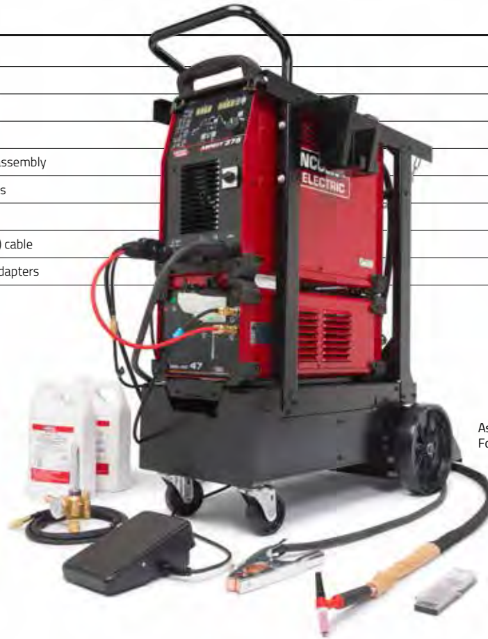
Aspect 375 Ready-Pak with Foot Amptrol™ Shown (K3946-2)